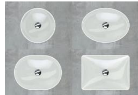
← VariForm washbasins are available in four basic shapes – round, oval, elliptic and rectangular.

All VariForm washbasins stand out due to their generous basin depth, which ensures a very comfortable washing experience for the user. Thanks to its use of high-quality sanitary ceramic, the surface of the washbasins is crack-proof, scratch-proof as well as easy to clean and remains beautiful for a very long time even with heavy use.