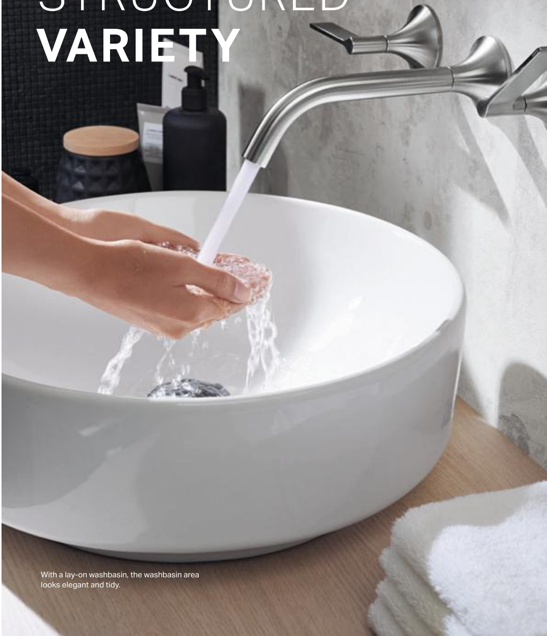
With a lay-on washbasin, the washbasin area looks elegant and tidy.

The look of a bathroom and its washbasin area is largely determined by the washbasin. Geberit offers appropriate washbasins in all sizes, designs and installation types.