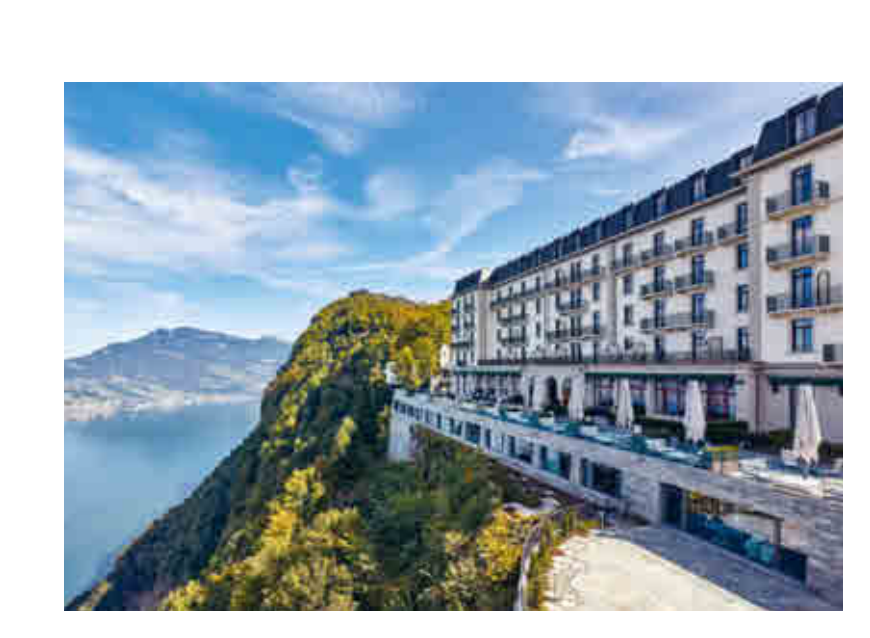
The Palace (built in 1903) is now shining in new splendour following extensive restoration work.

Apart from the classically styled Palace, the rest of the hotel resort is now unrecognisable. In the most prominent position is the flagship of the new resort – the Bürgenstock Hotel with its dark limestone facade. The top station of the funicular is located inside