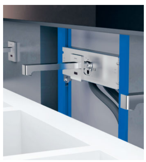
↑ It is now possible to install a wall-mounted tap perfectly at the first attempt. An X-ray view through the prewall shows that the tap is firmly anchored to a Geberit installation element.