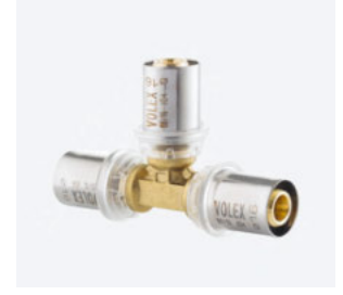
↑ The transparent plastic rings on the Volex press fittings make it easy to check the correct insertion depth.