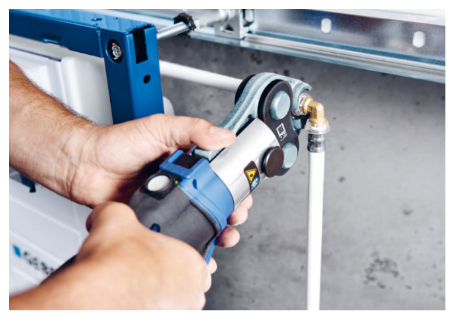
\ensuremath{\uparrow} The press connections are reliable and leakproof, and make it possible to work efficiently on the construction site.