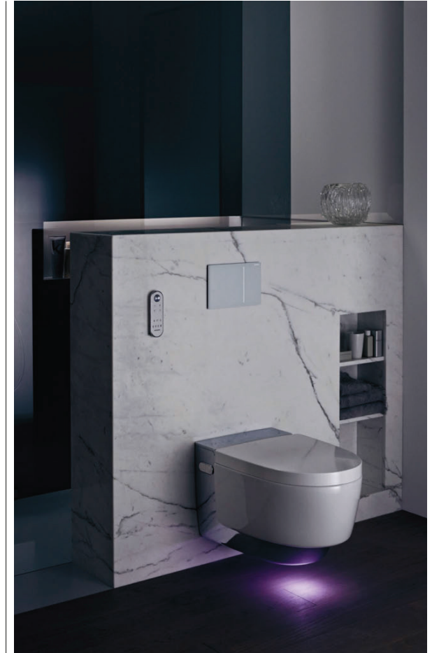
↑ Thanks to its state-of-the-art technology and excellent design, the Geberit AquaClean shower toilet is very compact. The chrome-plated design cover (also available in white) creates the impression that the appliance is floating.