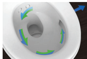
↑ Effective odor extraction also adds to the feeling of well-being.

Mia Odermatt, a sales promoter who grew up in a house with a shower toilet