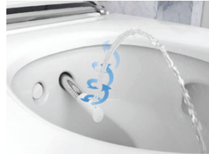
↑ Not all shower sprays are the same. Geberit has further perfected the shower experience with its WhirlSpray shower technology.

The new Geberit AquaClean Mera, available as from September 2015, highlights this progress in impressive fashion. Virtually unrivaled in terms of comfort functions and refinement, the new shower toilet from Geberit exudes elegance and appears to float weightlessly above the floor. When developing this appliance, Geberit spared no effort and utilized its many years of experience in the shower toilet sector, its broad technical know-how and its thorough understanding of customer needs to the full. ←