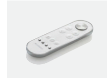
← The remote control is clear and fits comfortably in the hand. All inputs can be made with one hand. One click of a button is all that is required to call up the personal settings.