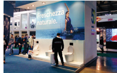
↑ Geberit showcases its AquaClean shower toilets at a range of consumer fairs each year.

"I'd rather have a shower toilet than a new handbag!"