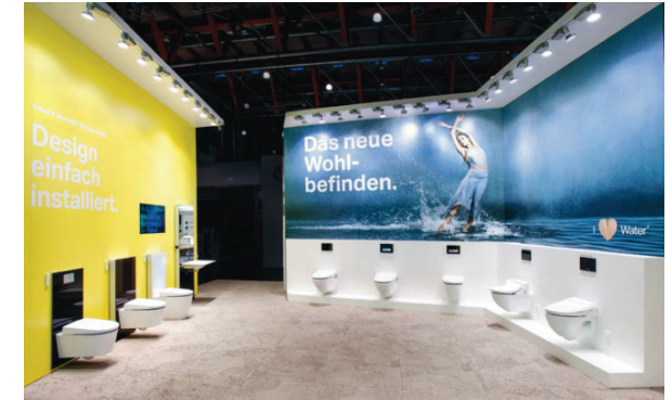
↑ Wholesalers and sanitary professionals also have the opportunity to carefully examine the shower toilet product range from Geberit at various trade fairs and exhibitions.

A generational effect is also becoming increasingly noticeable. Young people who grew up in a house with a shower toilet do