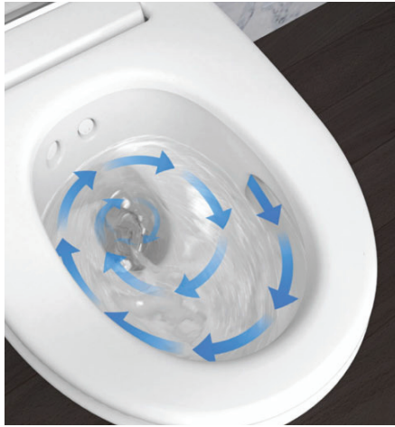
↑ Just how perfectly design and function can go hand in hand is highlighted by the inner geometry of the new AquaClean Mera. This ensures that flushing of the rimless WC ceramic appliance is quiet, very thorough and does not cause any water splashes.

not wish to do without this comfort when they fly the nest or buy a home of their own. However, they often demand higher standards than their parents did when it comes to the design of their bathroom fixtures.