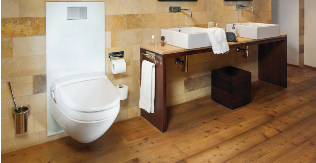
↑ Shower toilets are no longer uncommon in the bathrooms of four-star and five-star hotels.

A fundamental change in thinking in European bathrooms