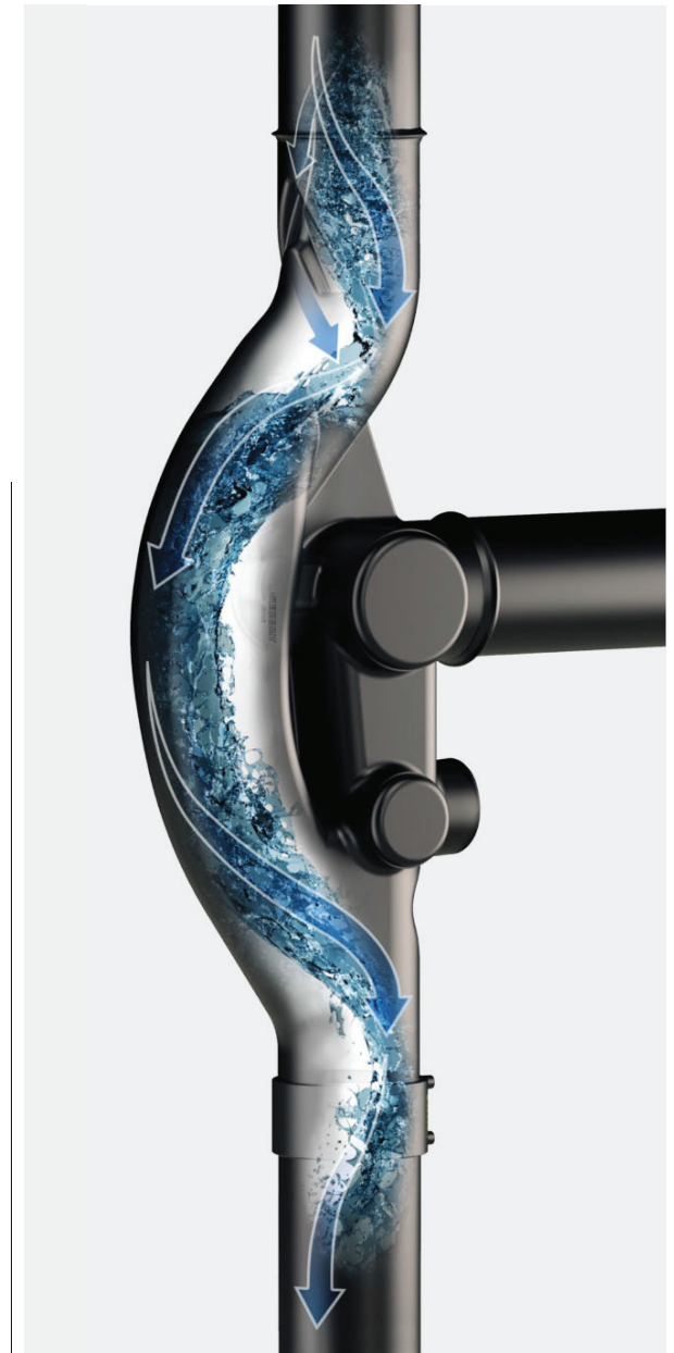
↑ This graphic visualization of the Sovent fitting is based on the data from the computer simulation.

This can be illustrated in greater detail using the Geberit Sovent fitting as an example. This fitting is used in high-rises to connect the discharge pipes from the individual floor to the main discharge stack. As part of the product optimization process, the aim was to increase the product's discharge rate. The key question centered around the flow rate, both in terms of the limits of what can be achieved and the technical aspects required for its implementation. An everyday trick helped Öngören's team find the solution to the problem: If you hold a bottle filled with water with the opening facing downwards and rotate it slowly, a column of air can form. This air column ensures pressure compensation, which significantly accelerates the water's discharge rate.