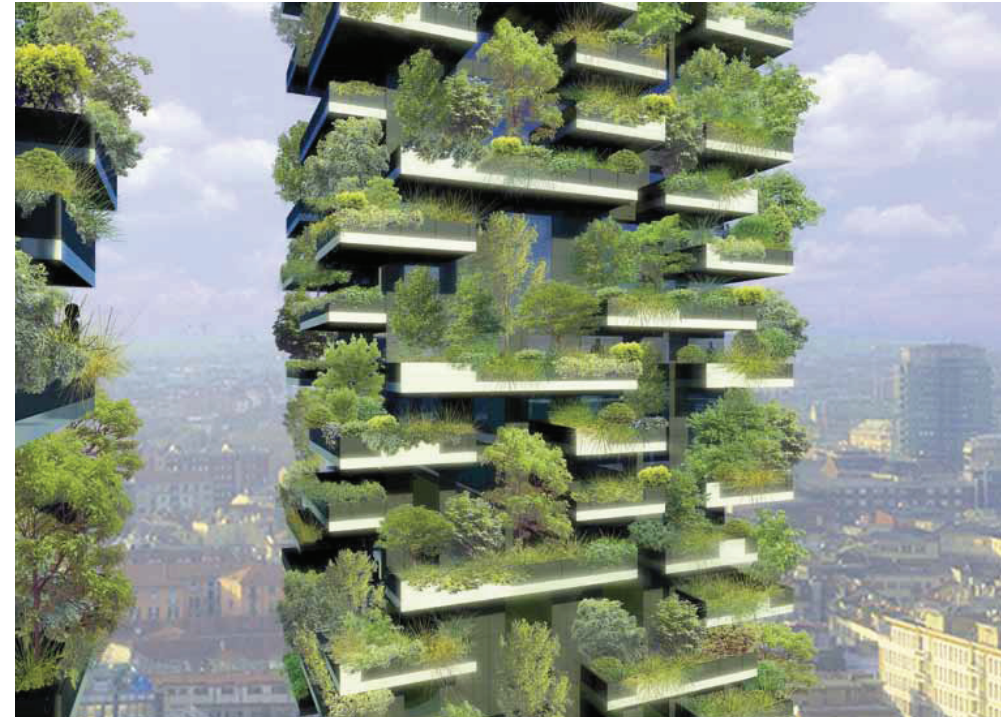
↑ The two "Bosco Verticale" residential towers will feature a living area of 50,000 square meters and 10,000 square meters of forest.

and conferences. 30 percent of the total office space is reserved for these open spaces.