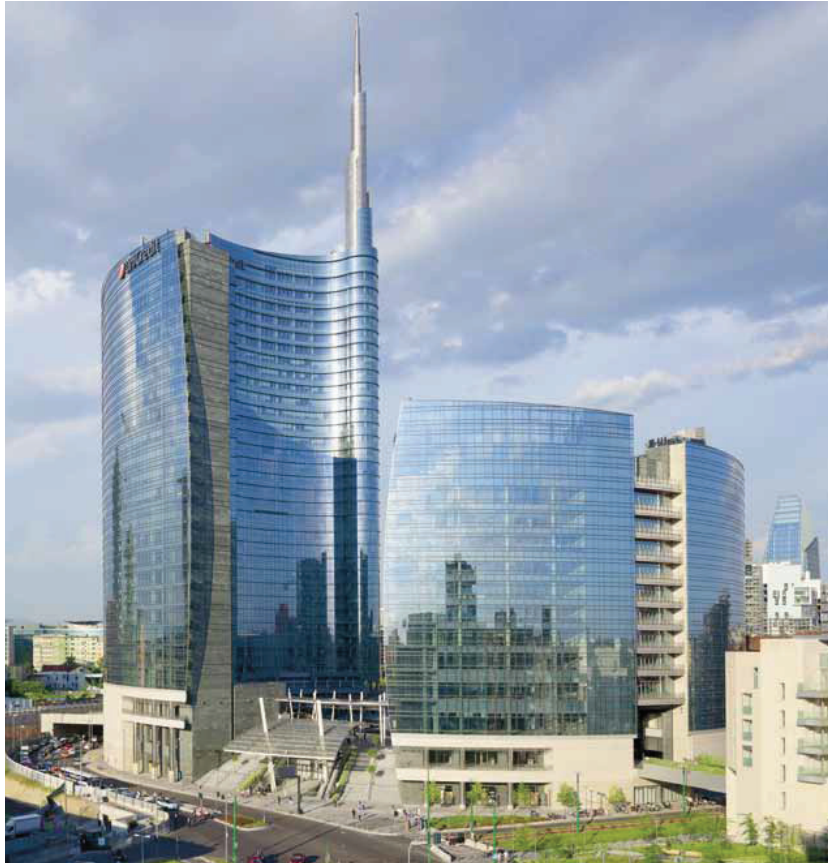
↑ Already completed is the 231-meter-high UniCredit Tower designed by Cesar Pelli, a high-rise complex that towers over all the other buildings.

UniCredit Tower, Porta Nuova Garibaldi, Milan (IT) Building owner: Hines Italia, Milan (IT) Architects: Pelli Clarke Pelli Architects, New Haven (USA) Completion: 12/2012 Plumber: Cefla Impianti Group, Milan (IT) Geberit know-how Sigma concealed cisterns 12 cm (UP300) PE piping systems PE Solvent fittings d110 → Green building: LEED Gold certification