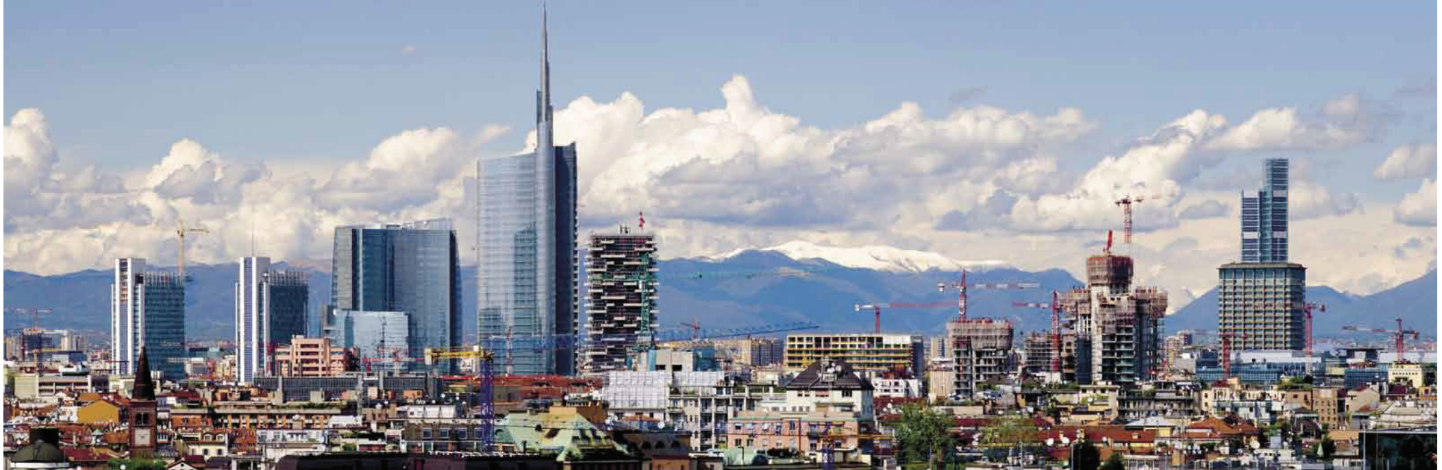
↑ A new urban district is being created in the heart of Milan – Porta Nuova. 20 high-rise buildings, parks, underground car parks and a metro station are currently being built here in accordance with stringent sustainability criteria.